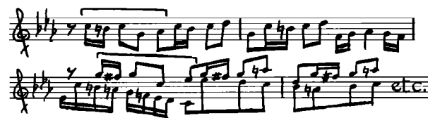
FIG. 2. The beginning of "Fuga II" by J. S. Bach. The first phrase of the subject is bracketed in each appearance.

Note that the versions shown in Expressions 4-7 of this brief phrase preserve not only the contour of Expression 3, but the relative sizes of temporally adjacent intervals as well. Using mathematical symbols to express the relationships between successive intervals in which the absolute value of the first interval of each pair is smaller than, equal to, or larger than that of the