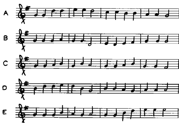
FIG. 3. The first two phrases of each of the undistorted versions of melodies used in Expt. 2: (a) "Twinkle, Twinkle, Little Star"; (b) "Good King Wenceslaus"; (c) "Yankee Doodle"; (d) "Oh Susanna"; and (e) "Auld Lang Syne."

and ascending two octaves (to 2093 Hz). Every effort was made to maintain the same tempo in all stimuli. Stimuli were tape recorded and played to the subjects over loudspeakers as in Expt. 1.