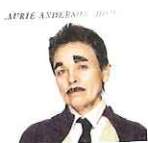
Laurie Anderson Homeland (Nonesuch)