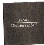
Joe Colley Disasters Of Self (Crippled Intellect Productions)