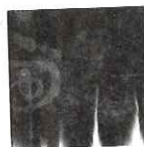
Seijaku Mail From Fushitsusha (Doubt Music)