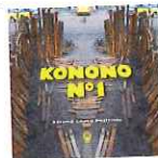
Konono No 1 Assume Crash Position (Crammed Discs)