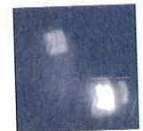
Marina Rosenfeld Plastic Materials (Room40)