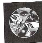
Demdike Stare Liberation Through Hearing (Modern Love)