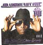
Big Boi Sir Lucious Left Foot: The Son Of Chico Dusty (Def Jam)