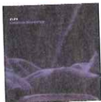
Eleh Location Momentum (Touch)