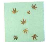
Hype Williams Hype Williams (Carnivals)