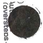
Autechre Oversteps (Warp)