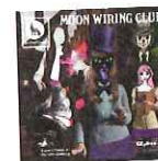
Moon Wiring Club A Spare Tabby At The Cat's Wedding (Gecophonics)