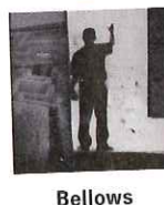
Bellows Handcut (Planam)