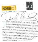
Derek Bailey More 74 (Incus)