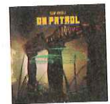
Sun Araw On Patrol (Not Not Fun)