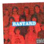
Tyler The Creator Bastard (OFWGKTA)