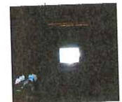
Emeralds Does It Look Like I'm Here? (Editions Mego)