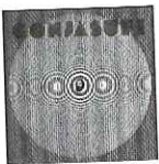
Gonjasufi A Sufi And A Killer (Warp)