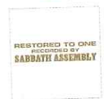
Sabbath Assembly Restored To One (Ajna/Feral House)