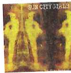
Sun City Girls Funeral Mariachi (Abduction)