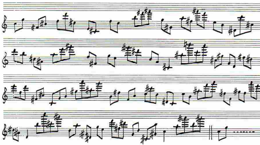
Fig. 7. David Feldman, excerpt from the score for "... still plenty of good music..." showing the 120-note repeating pattern that dominates the score (passage shown here begins at top of page 4). Phrase beamings added by Larry Polansky. © David Feldman 1994. Published by Material Press, Frankfurt-am-Main, Germany.